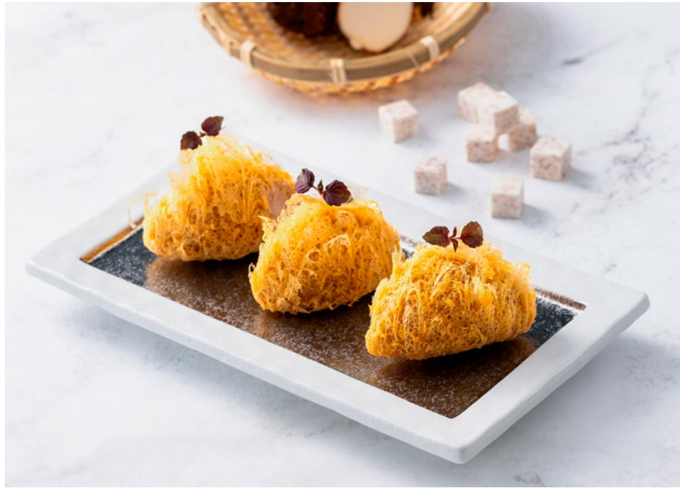
DS11 蜂巢芋角 crispy taro dumpling