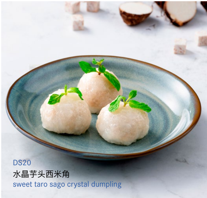
DS20 水晶芋头西米角 sweet taro sago crystal dumpling