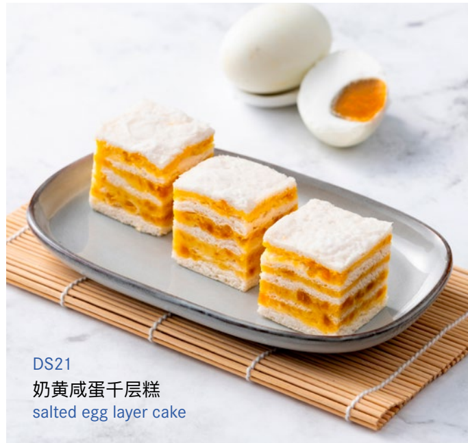
DS21 奶黄咸蛋千层糕 salted egg layer cake