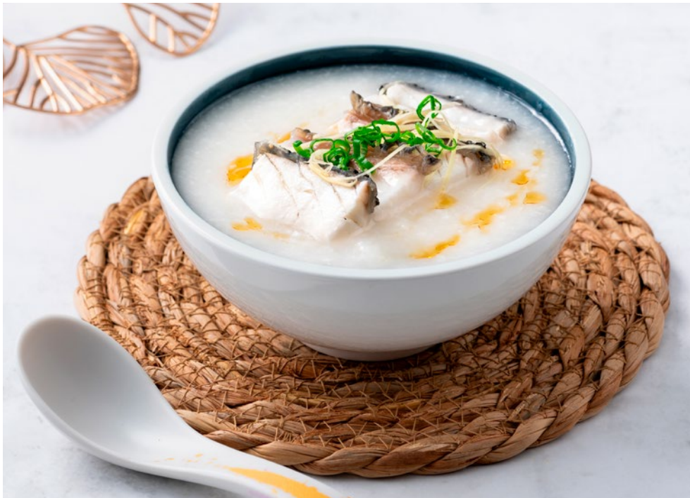
DS18 鱼片粥 sliced fish porridge