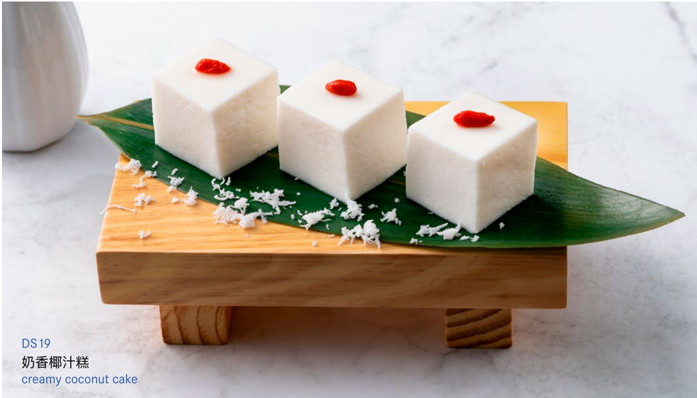
DS19 奶香椰汁糕 creamy coconut cake